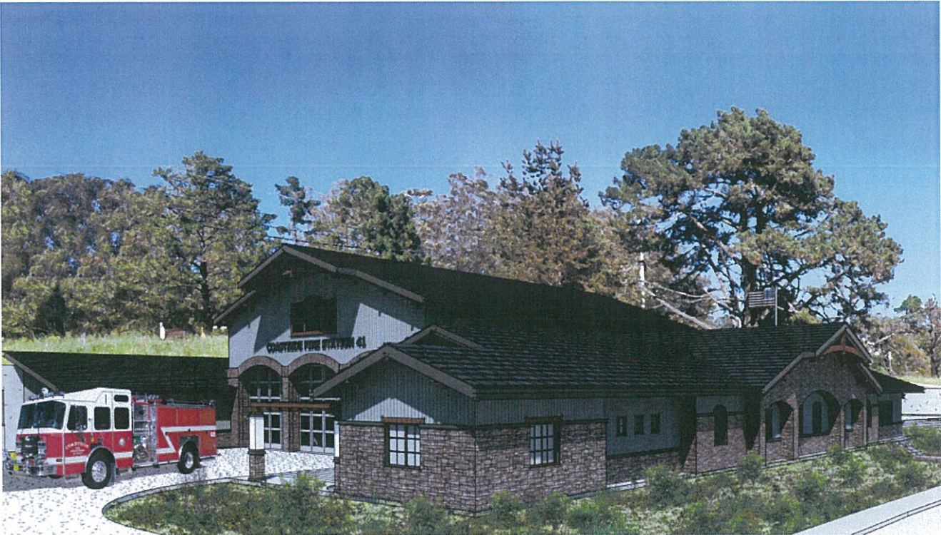
VIEW FROM OBISPO ROAD